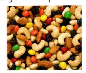
Sweet & Salty Trail Mix

Terrilyn's premium nuts, decadent confections, savory snacks, and tempting mixes are unlike anything you will find at your local grocery store. There is a range of 38 products to pick from.