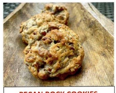
PECAN ROCK COOKIES USING FANCY PECAN PIECES

https://www.terrilynn.com/resources/recipes/pecan-rock-cookies