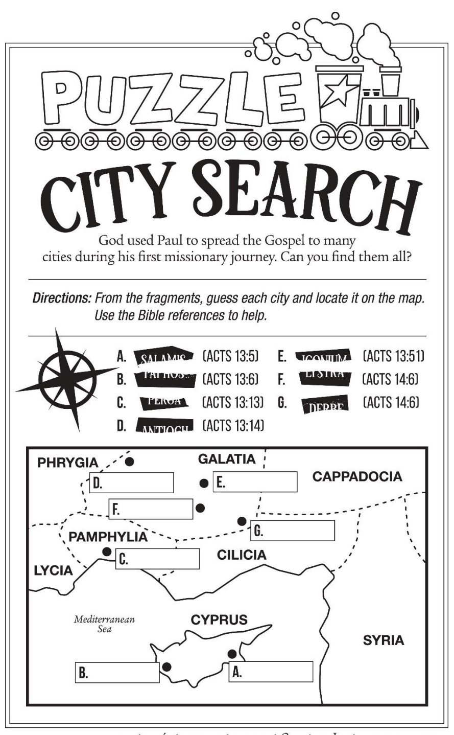
Answers: Salamis, Paphos, Perga, Antioch, Iconium, Lystra, Derbe

THE DEADLINE FOR SUBMISSIONS FOR THE NOVEMBER NEWSLETTER IS OCTOBER 24<sup>TH</sup>.