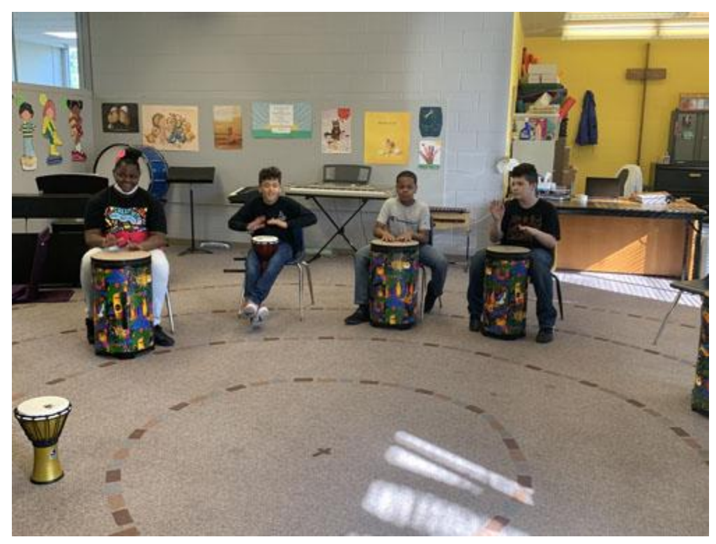
At Journeys, music is foremost praise and prayer but is also an important educational tool for special needs students.