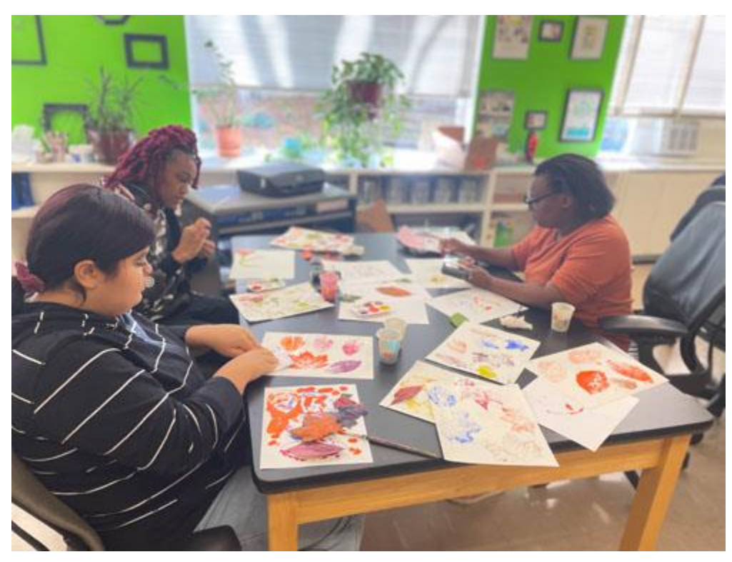
Journeys students love to express themselves through art and craft projects.